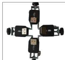
Motorcycle clamping jaw