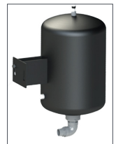
20L fixed inflation system