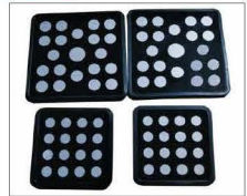
4 target plates